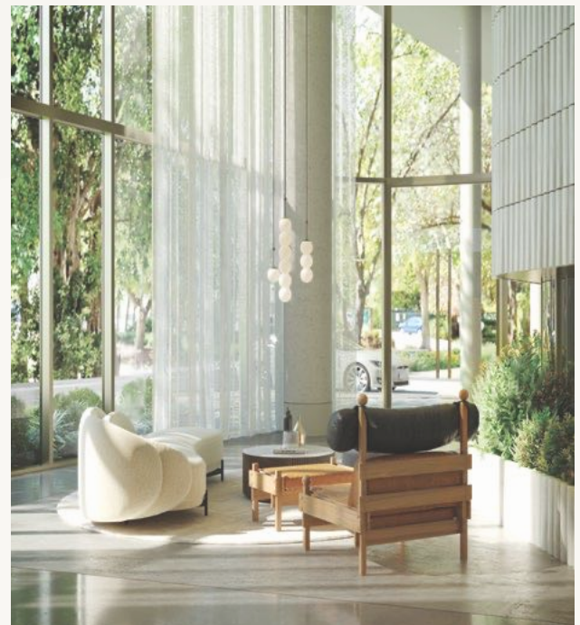
ARTIST CONCEPTUAL RENDERING. DEVELOPER MAY CHANGE WITHOUT NOTICE.