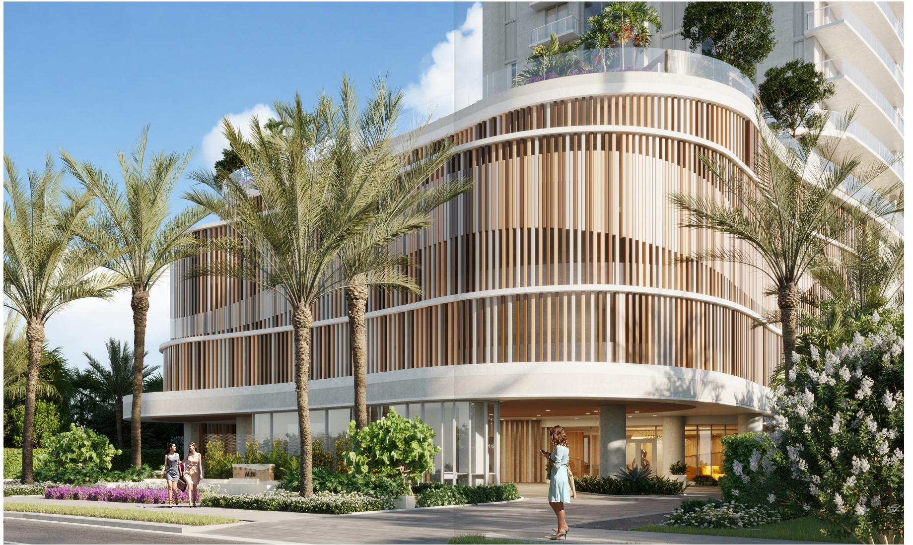
Arrival and porte cochere entrance