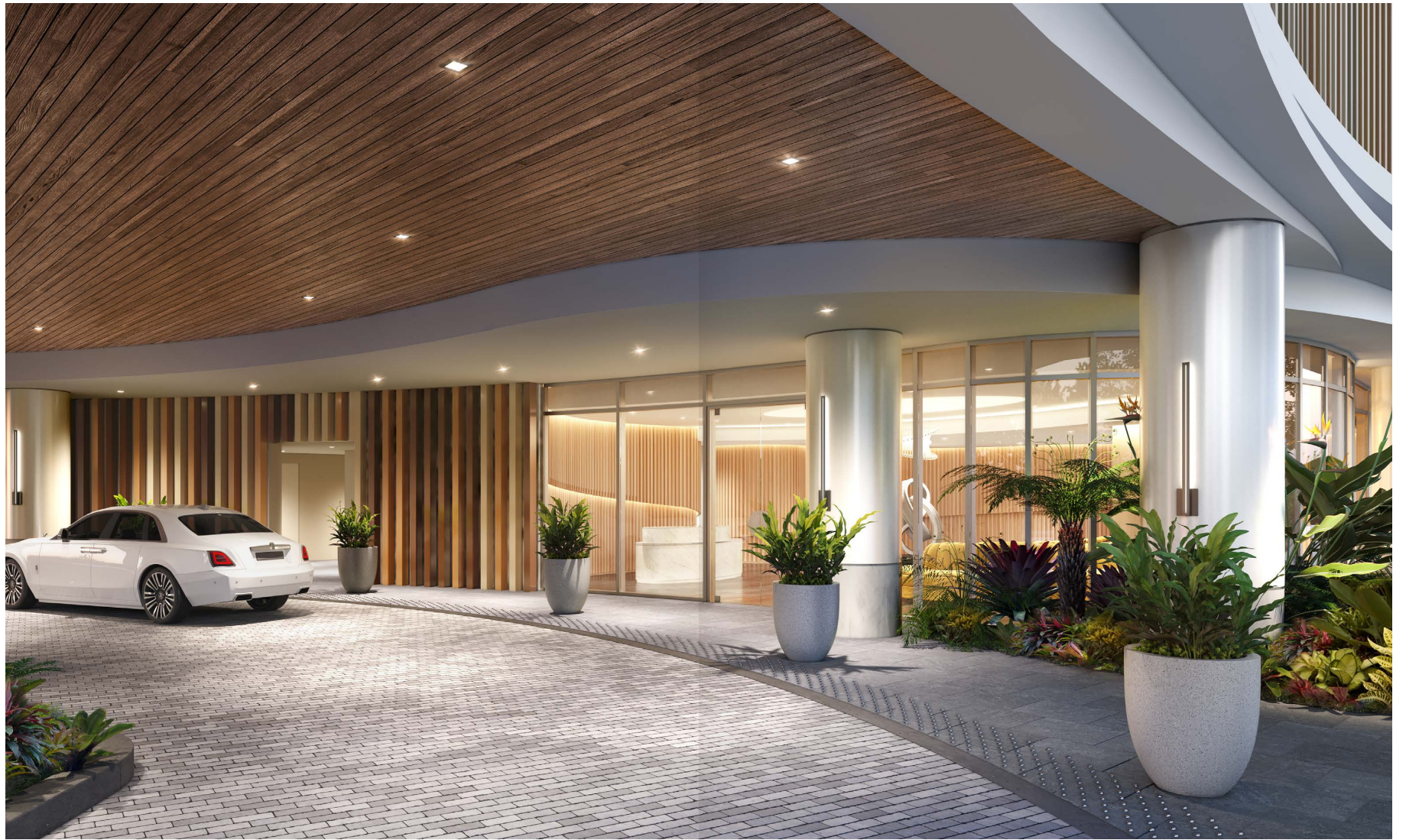
Private and secure arrival experience