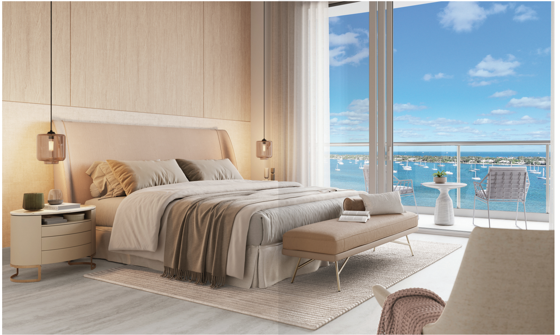
Expansive primary suites with endless views of the Atlantic Ocean and beyond