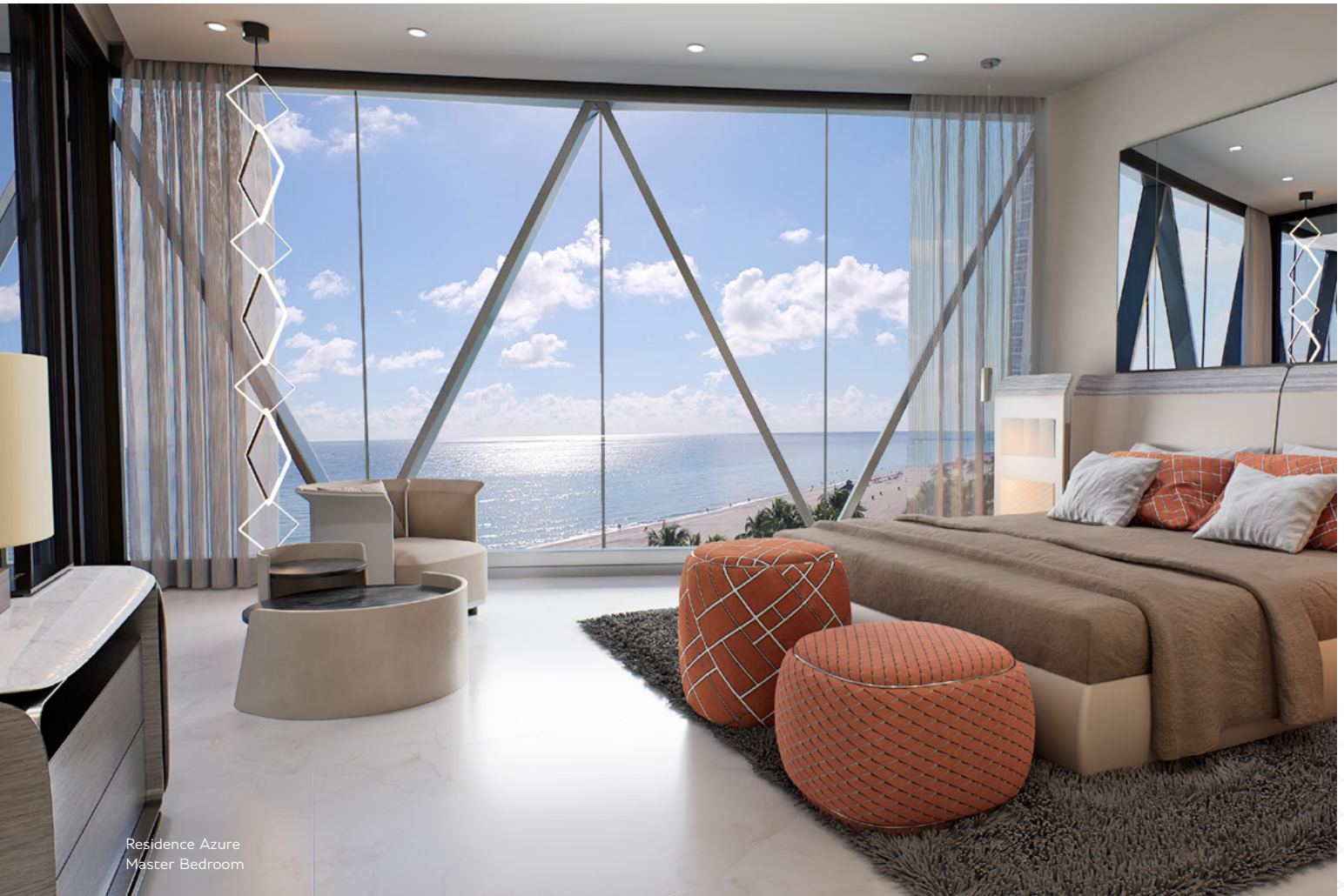
Residence Azure Master Bedroom