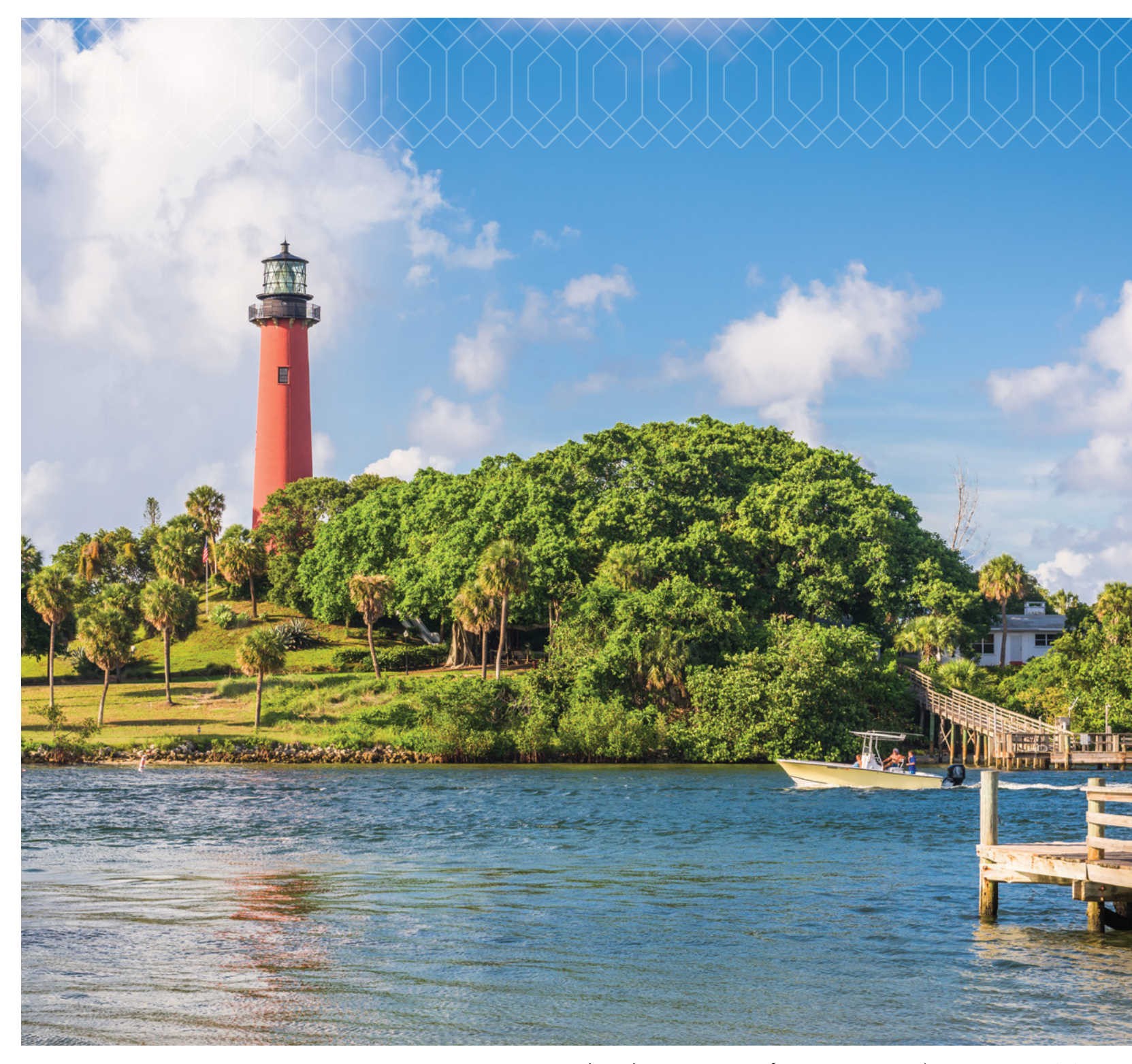
Jupiter Inlet Light House: An icon of Jupiter's Intracoastal Waterway since 1860