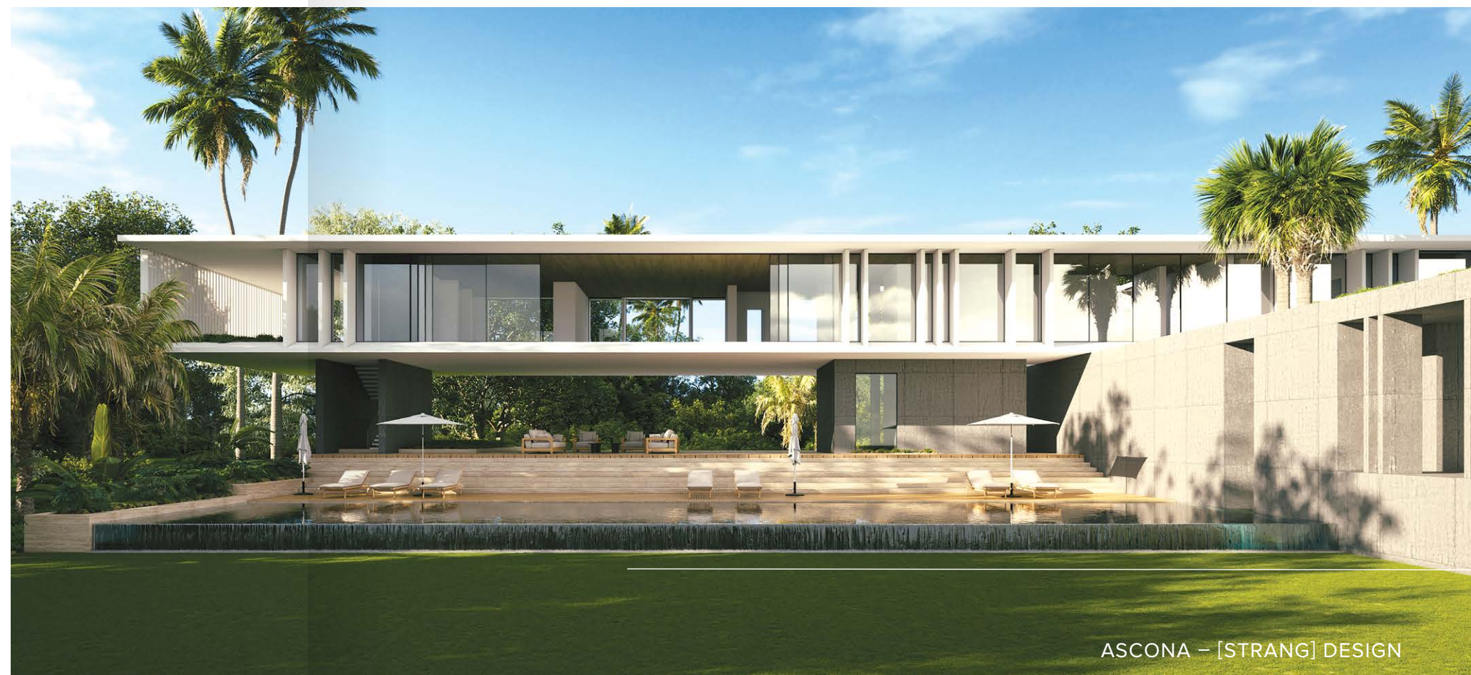
ASCONA – [STRANG] DESIGN