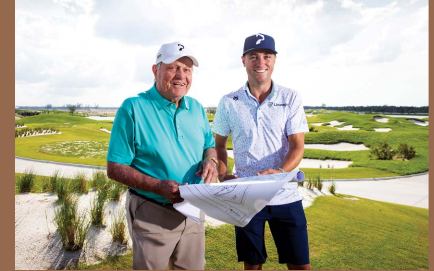
JACK NICKLAUS & JUSTIN THOMAS Course Designers