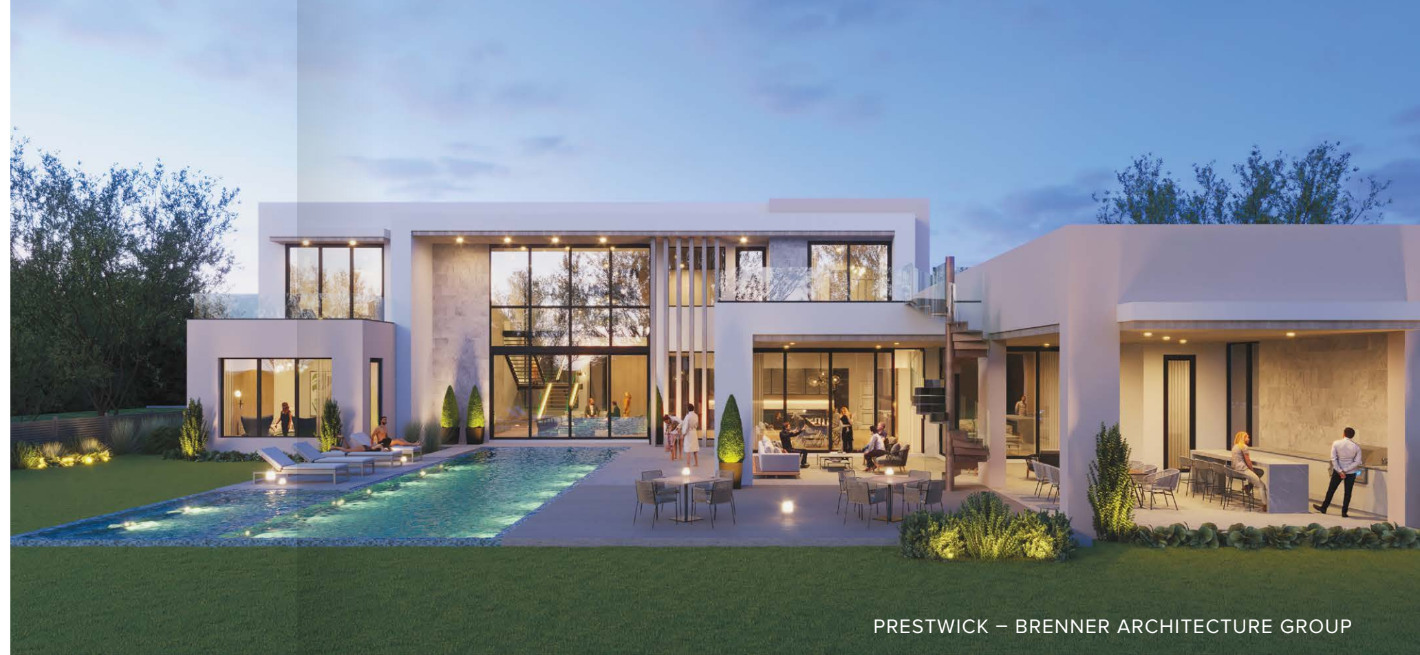
PRESTWICK – BRENNER ARCHITECTURE GROUP