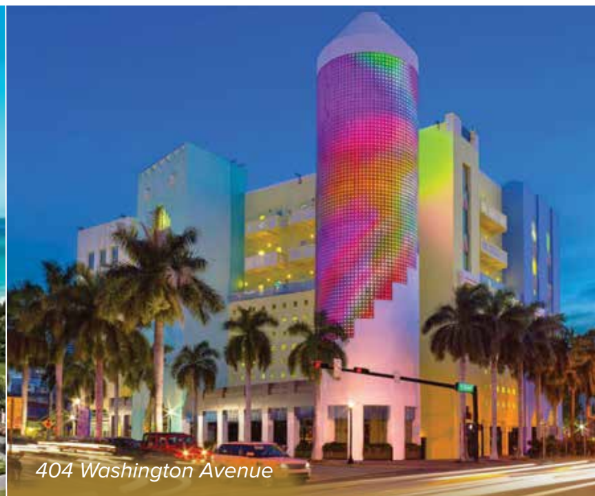
404 Washington Avenue