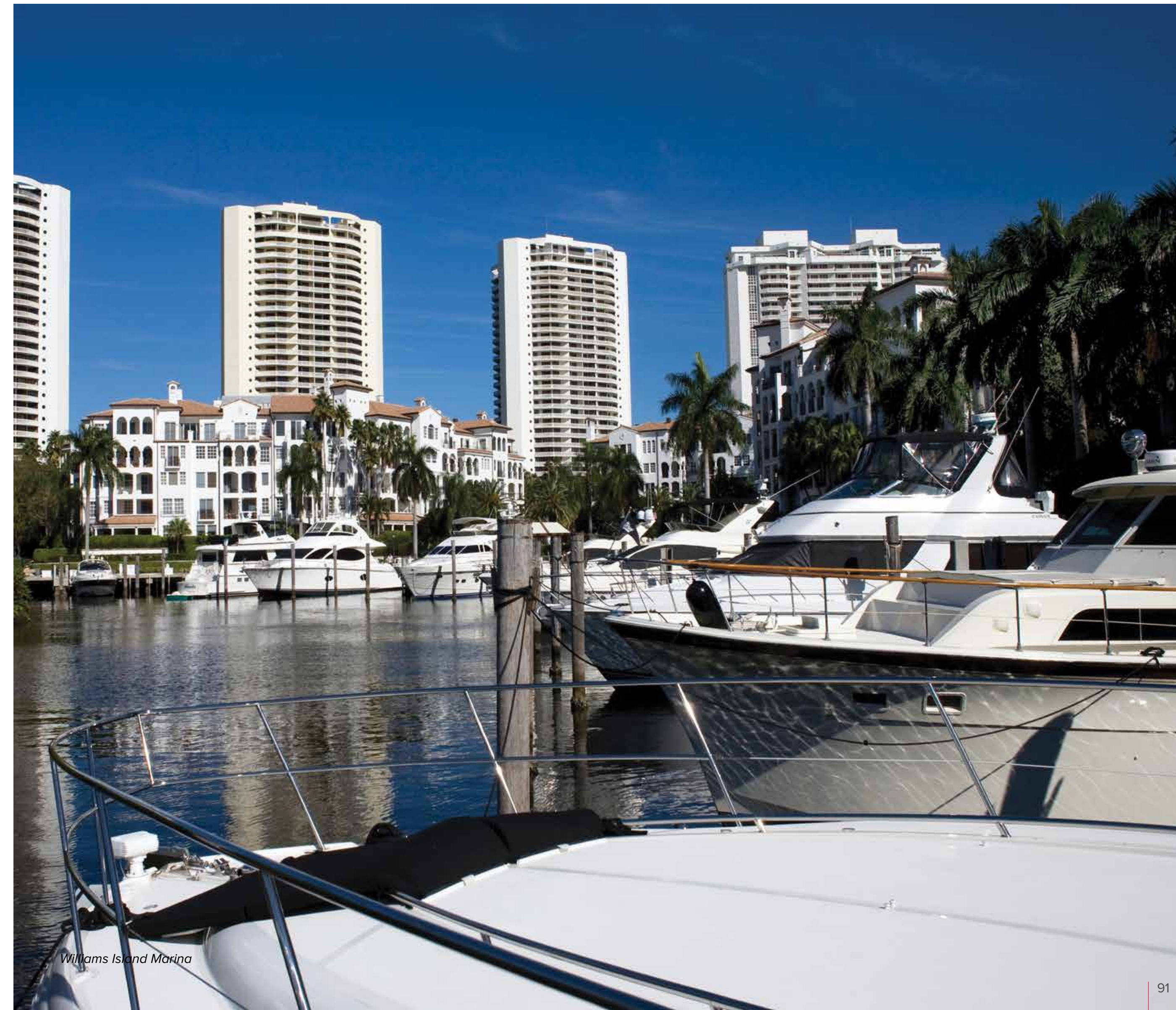
Williams Island Marina