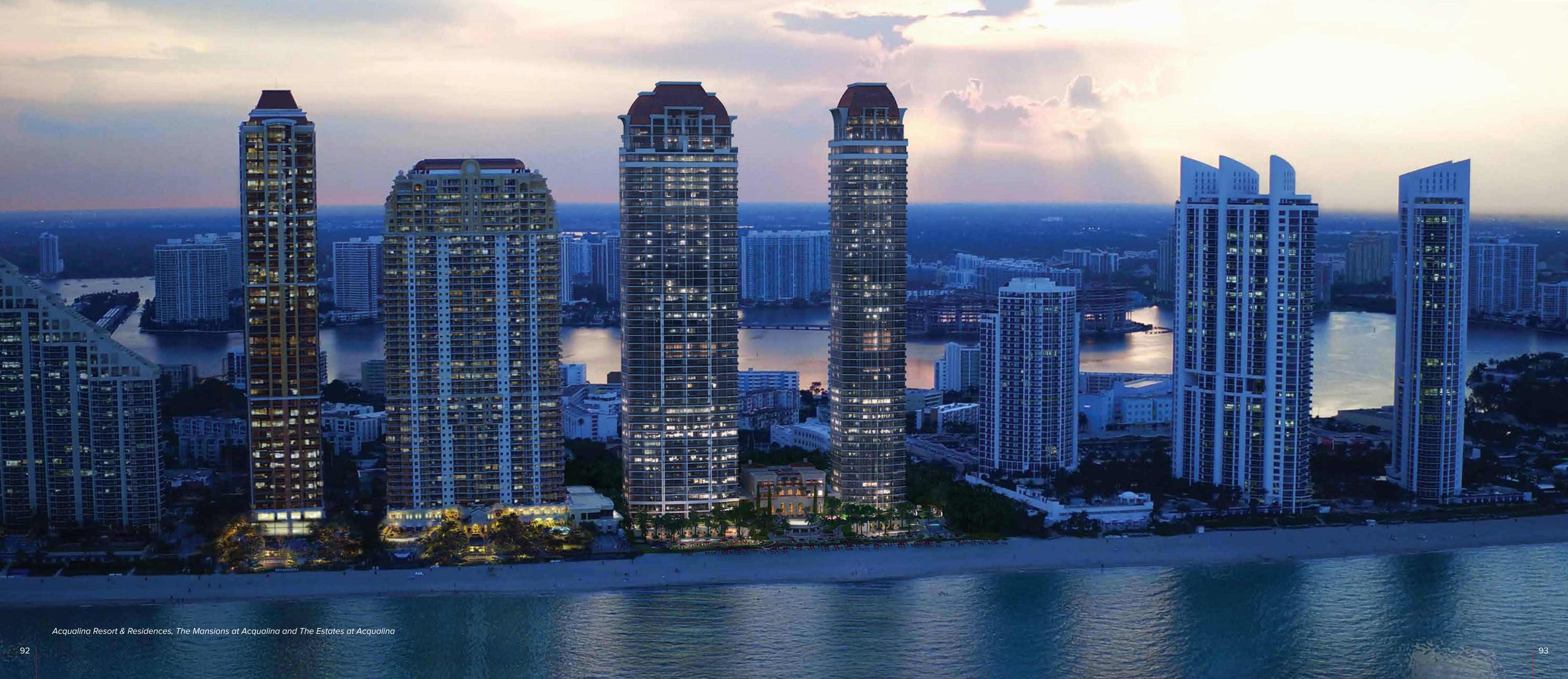
Acqualina Resort & Residences, The Mansions at Acqualina and The Estates at Acqualina