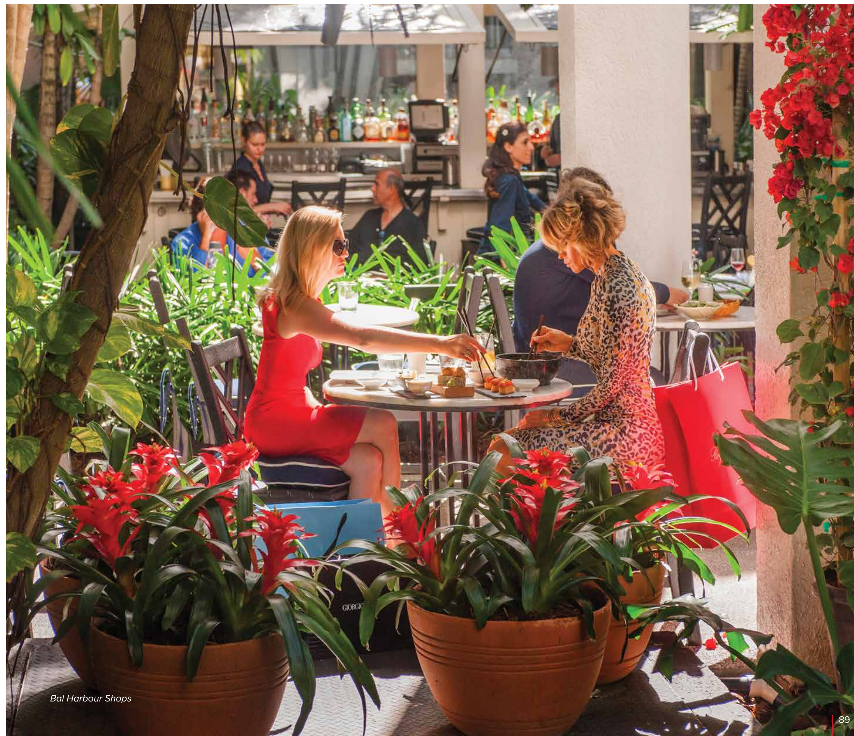
Bal Harbour Shops