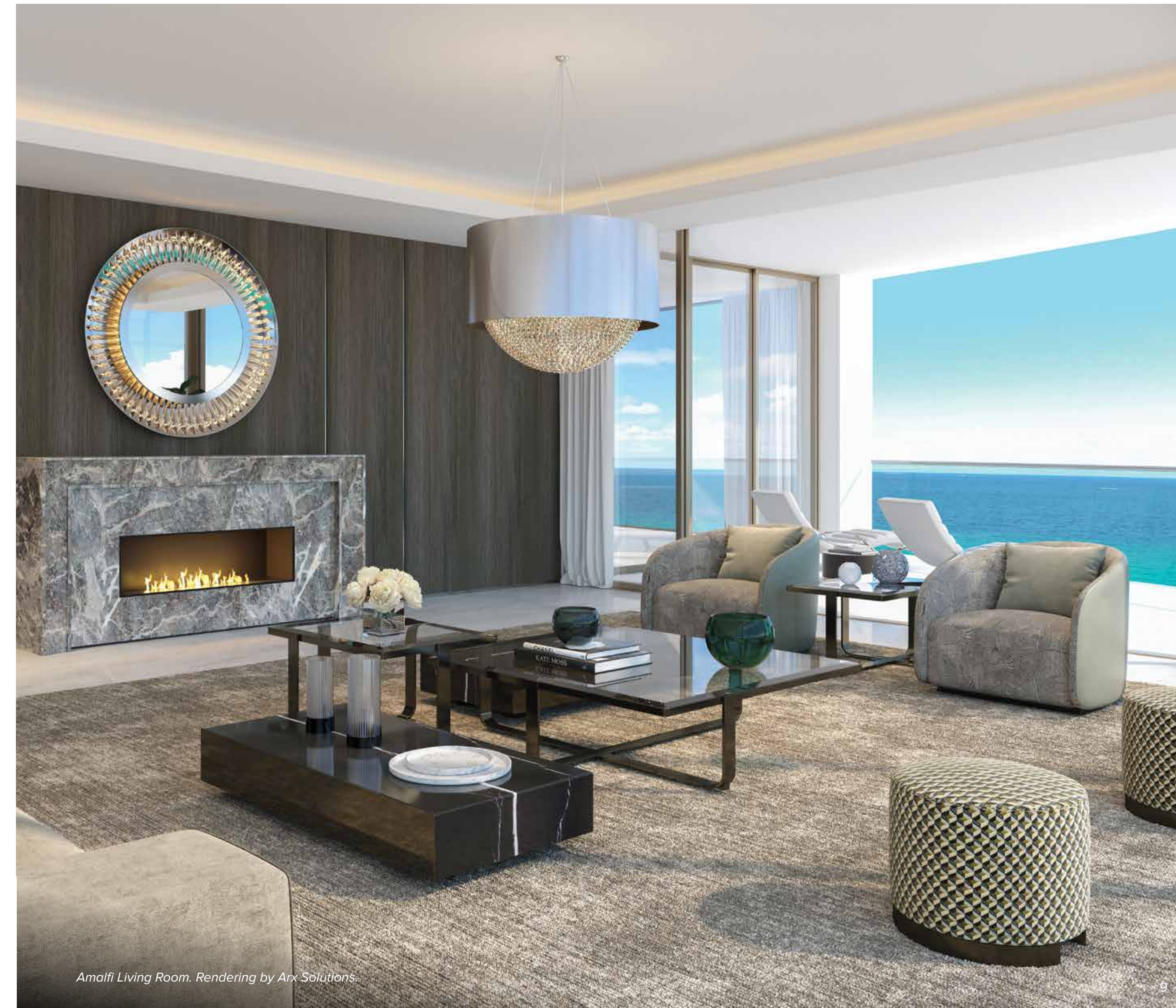
Amalfi Living Room. Rendering by Arx Solutions.

With a living space 57 foot long including a marble kitchen that is a true work of art – THE BOUTIQUE TOWER features two residences per floor and offers both glamour and convenience for the world's most discriminating buyers.