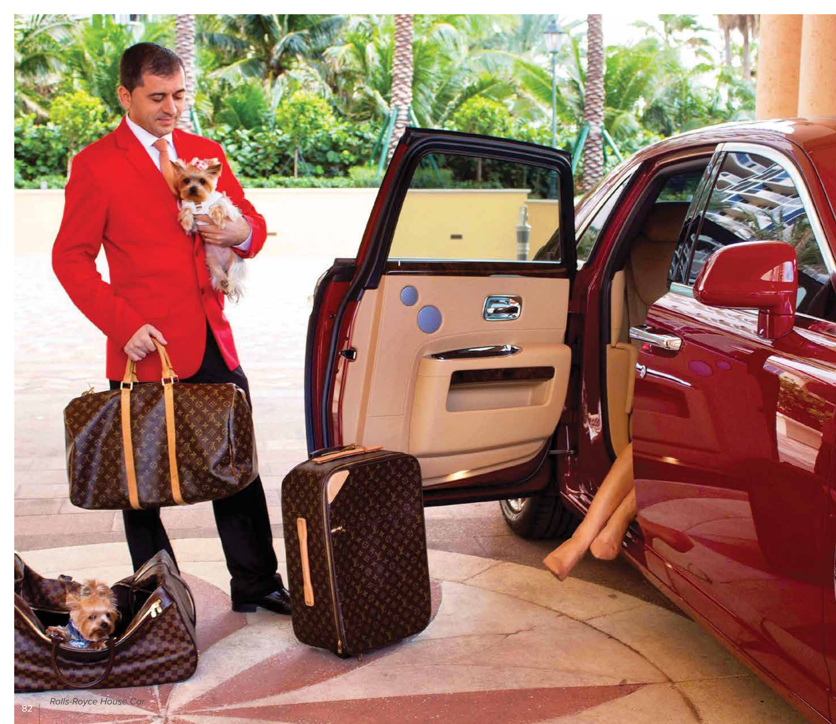
Rolls-Royce House Car