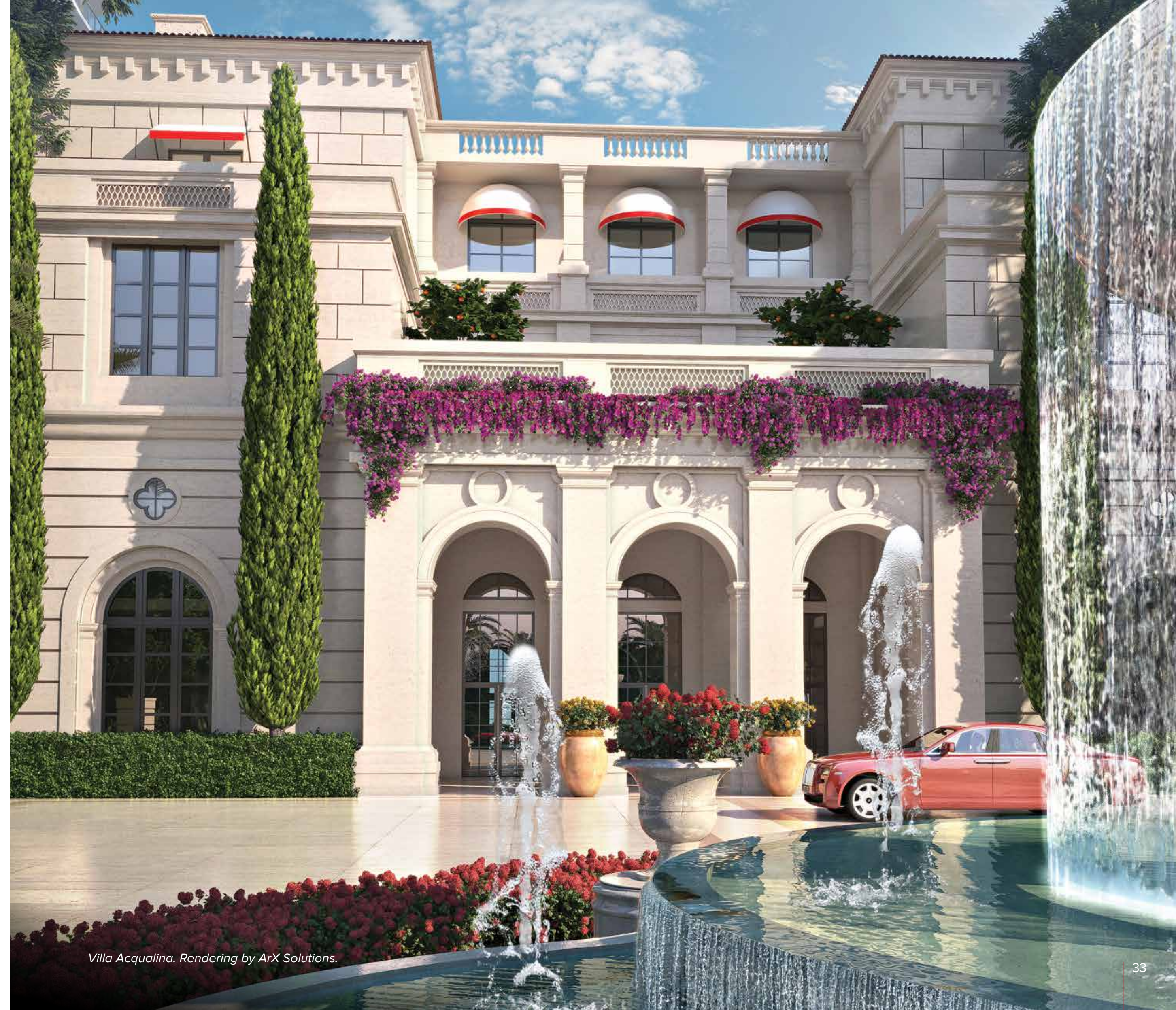
Villa Acqualina. Rendering by ArX Solutions.

The classically inspired five-story structure provides a go-to environment where neighbors get to know each other and a genuine sense of community is fostered and enjoyed.