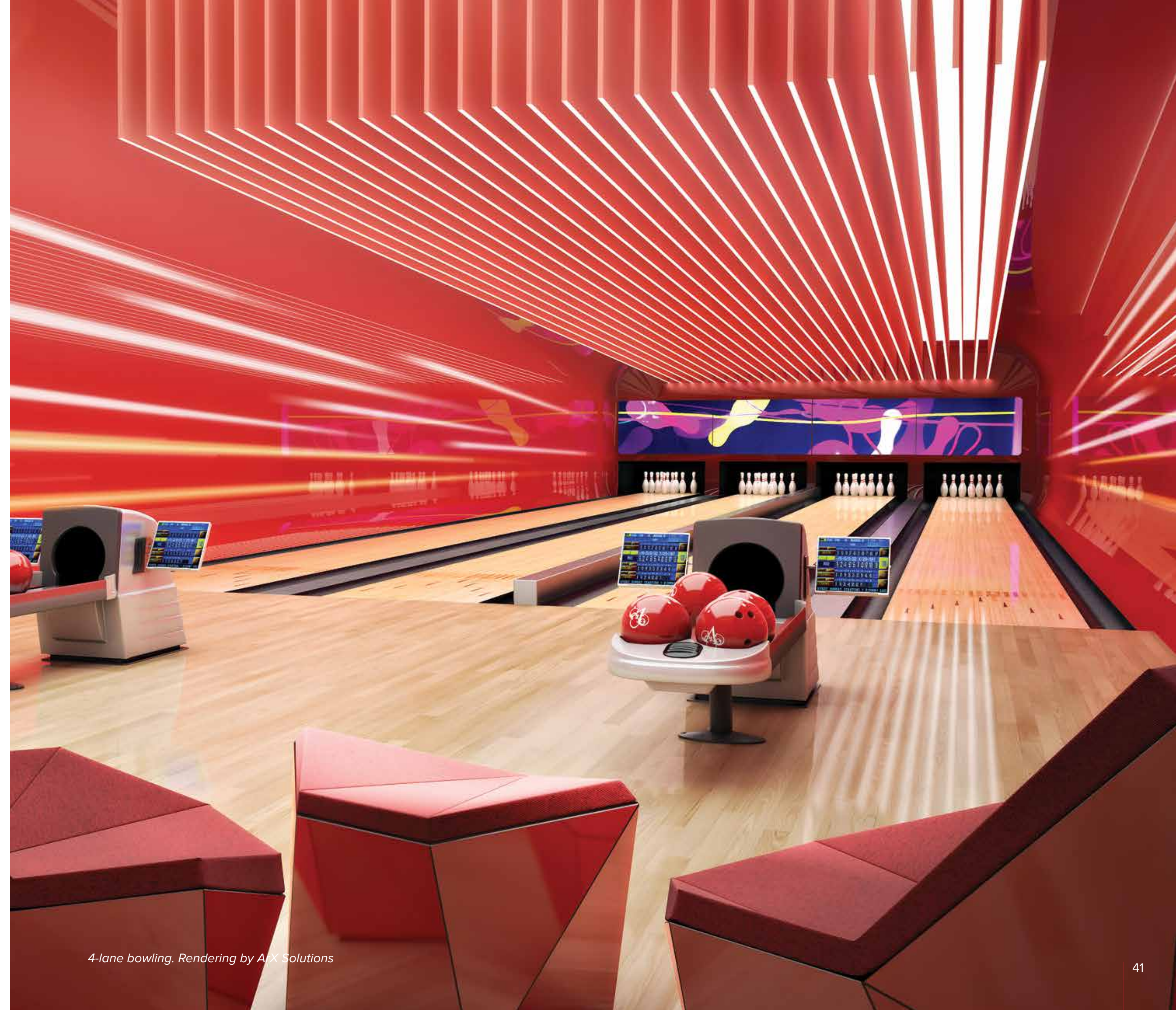
4-lane bowling.

At Circus Maximus – a full floor of entertaining amenities inside the Villa – life really is all fun and games. With something for every member of the family, this fluidly designed space features distinct amenities such as a golf simulator, a billiards area, an ice-skating rink, bowling lanes, a Formula One simulator, a kid's room, a teen lounge and an intimate movie theater. This is play time on an entirely new level.