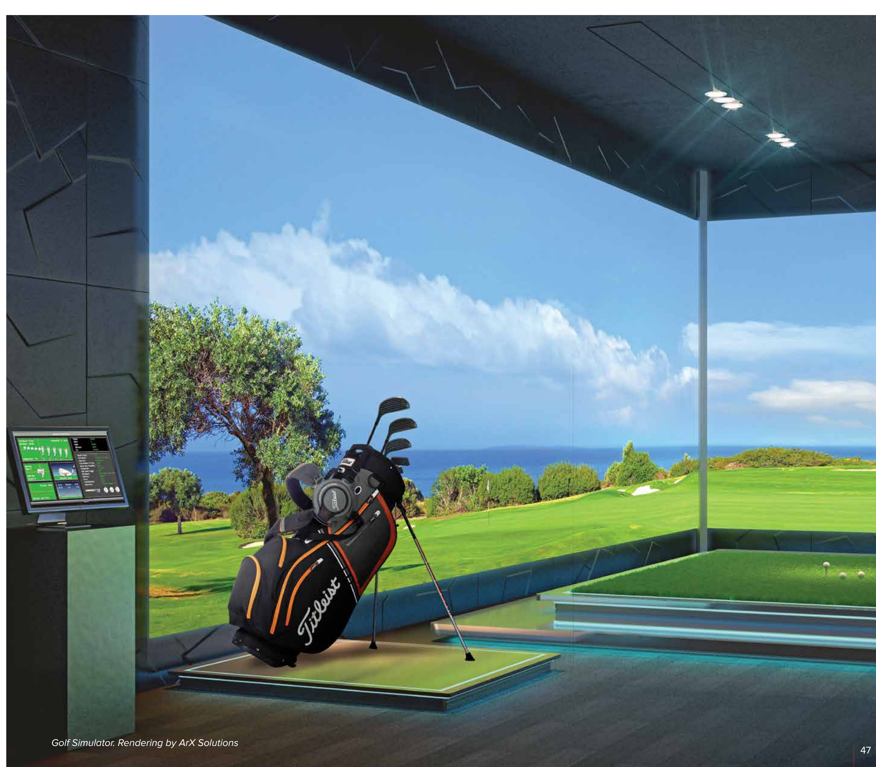
Golf Simulator. Rendering by ArX Solutions