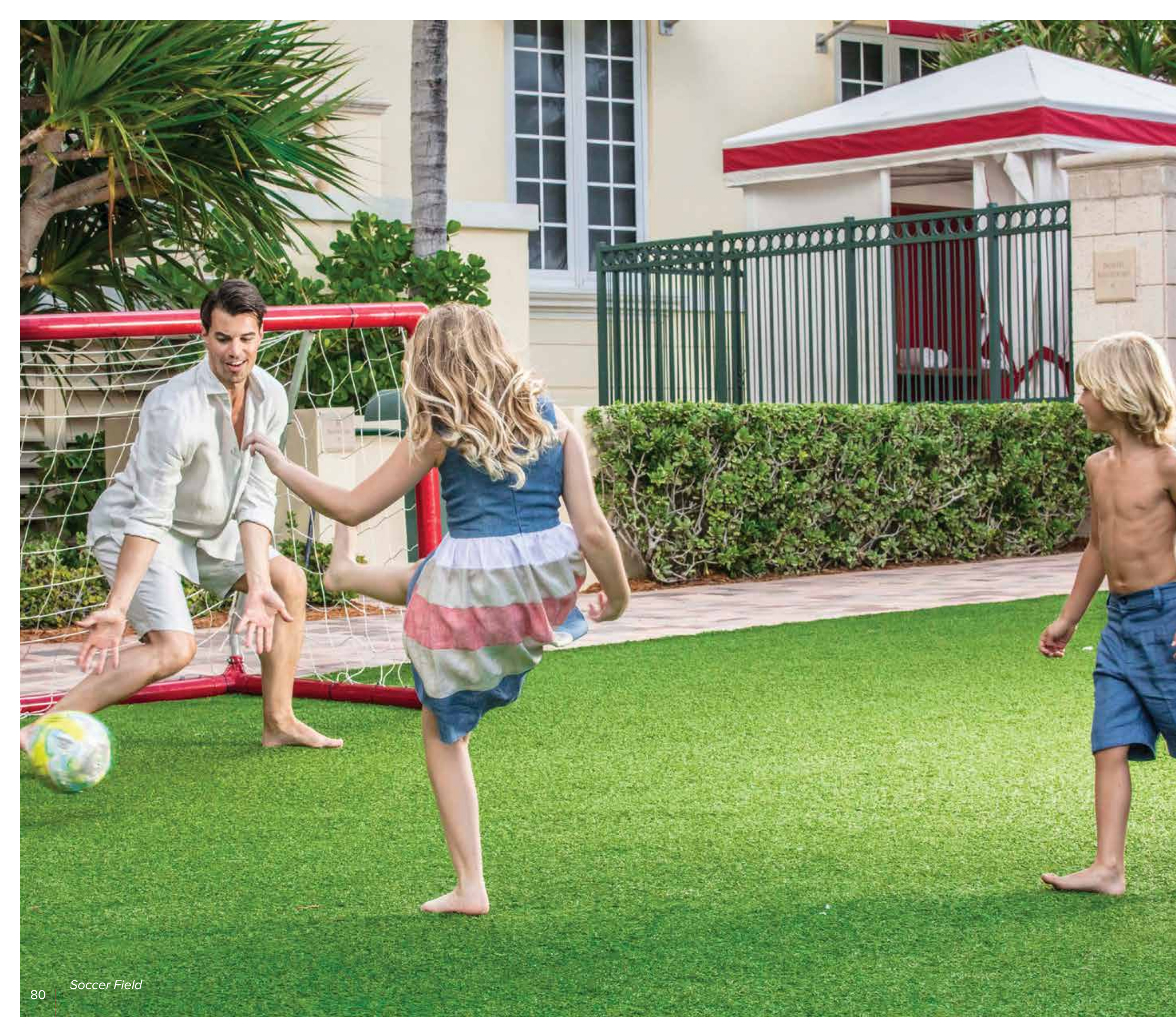
80 Soccer Field