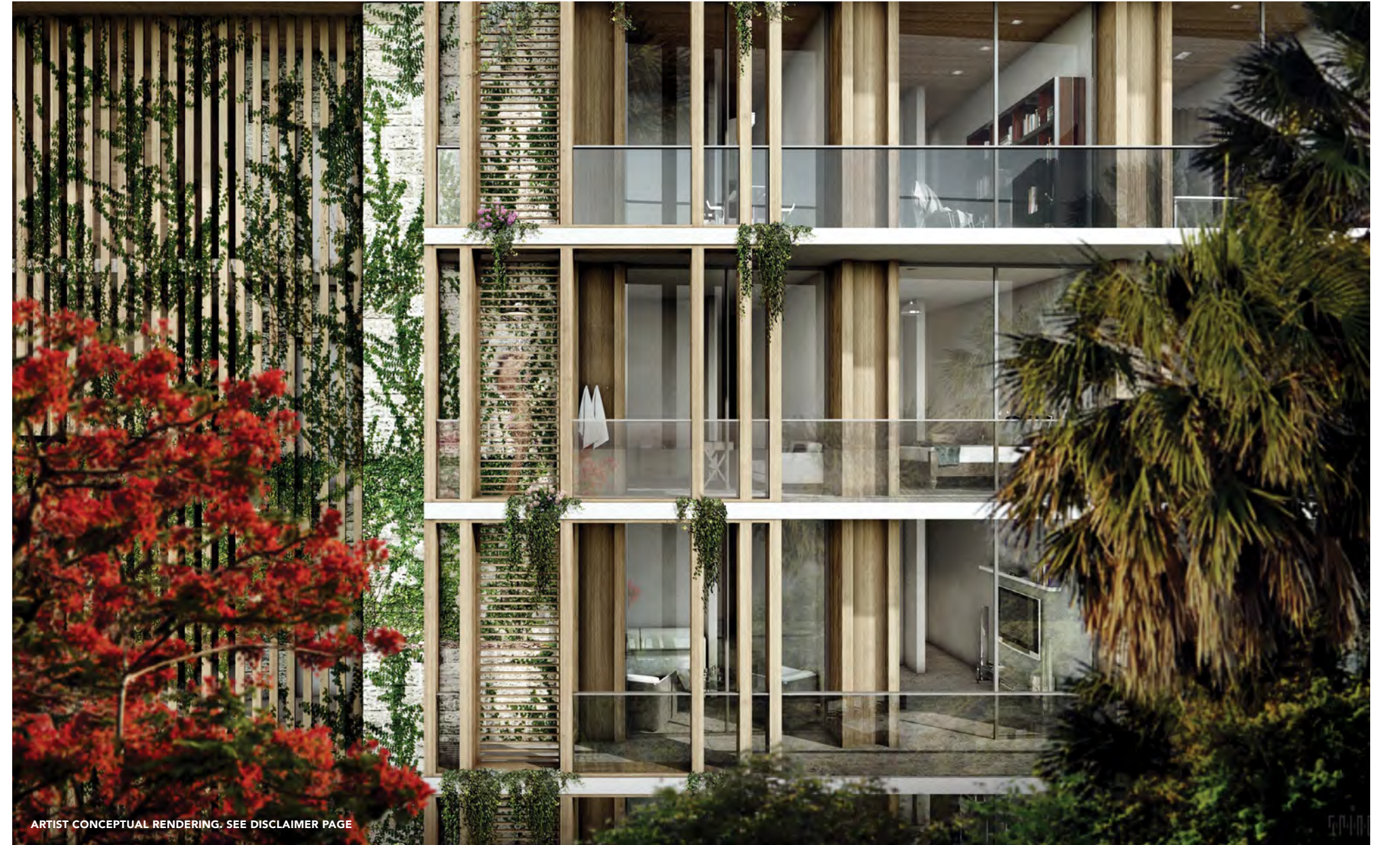
ARTIST CONCEPTUAL RENDERING. SEE DISCLAIMER PAGE