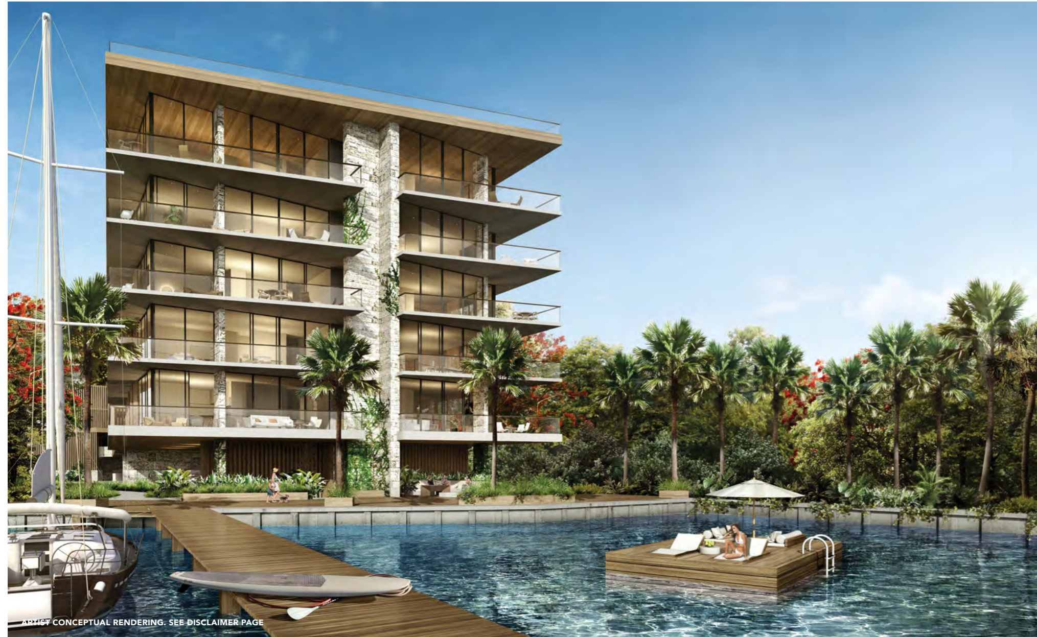
ARTIST CONCEPTUAL RENDERING. SEE DISCLAIMER PAGE