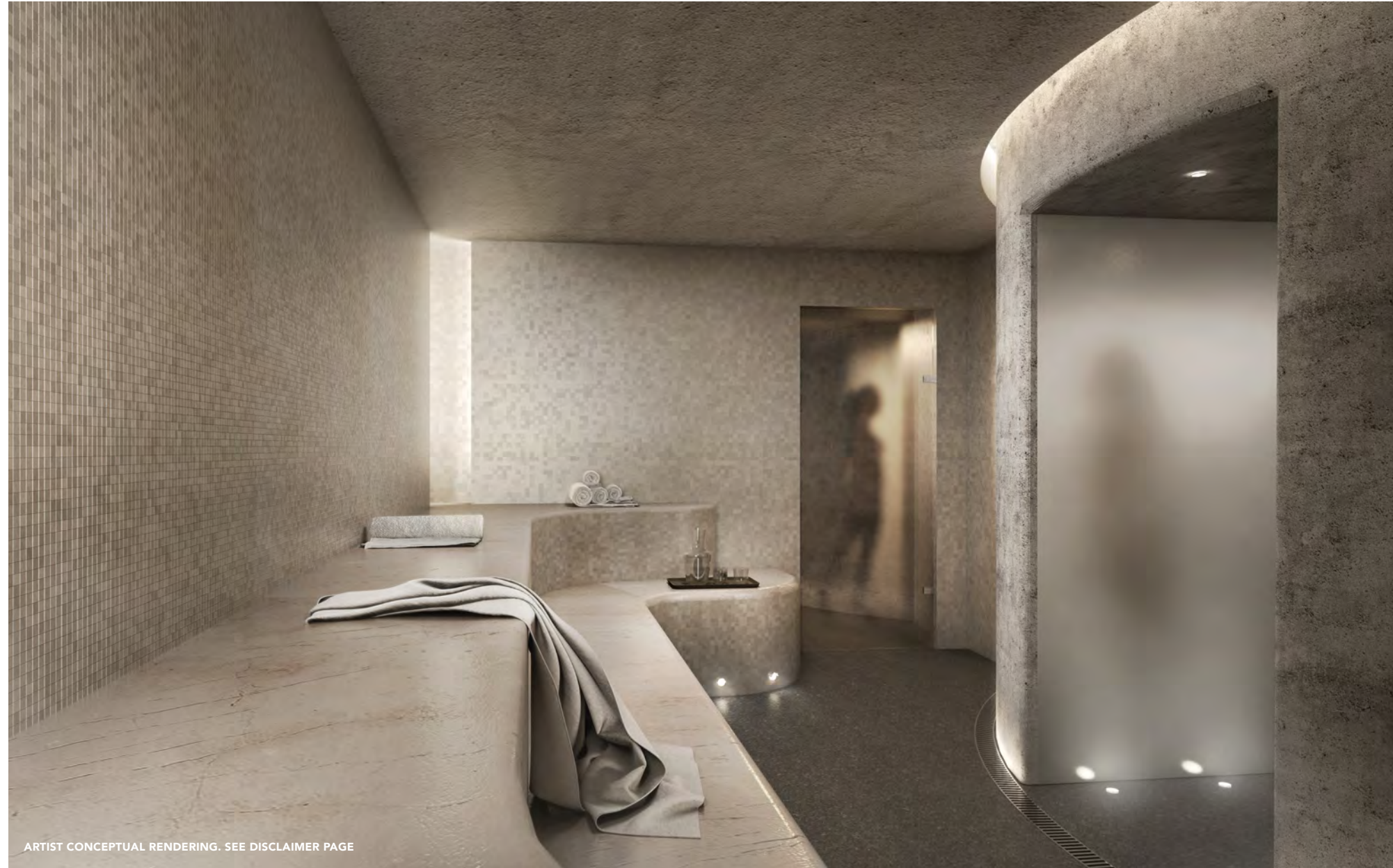
ARTIST CONCEPTUAL RENDERING. SEE DISCLAIMER PAGE