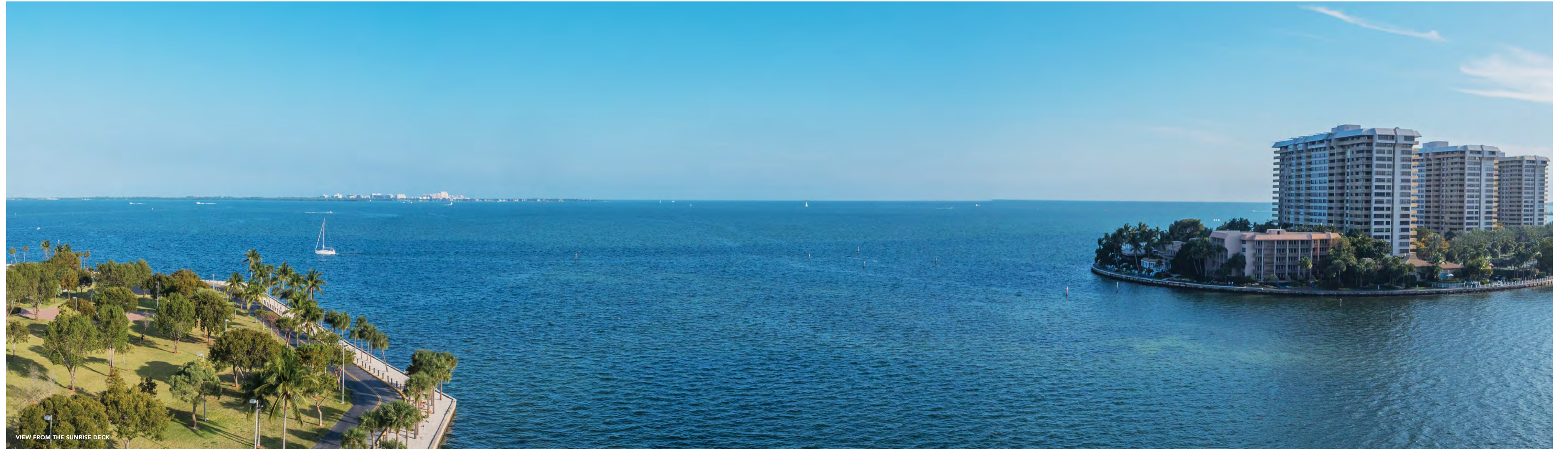
VIEW FROM THE SUNRISE DECK