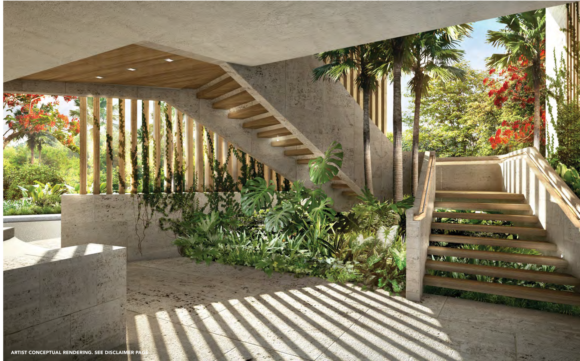
ARTIST CONCEPTUAL RENDERING. SEE DISCLAIMER PAGE